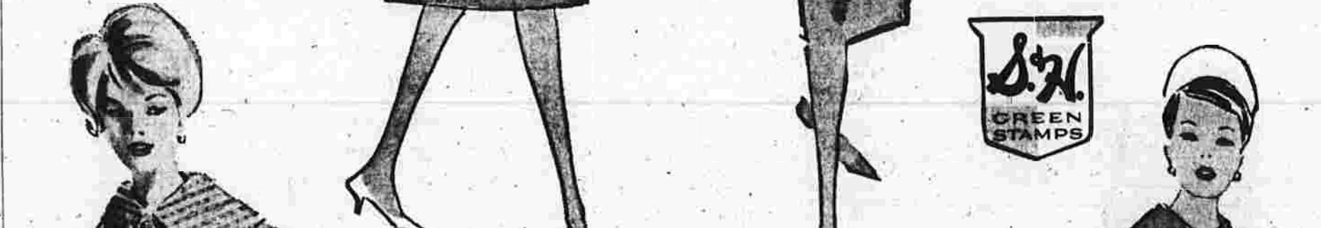
(left): stitched collar clutch coat, beige mint, black, 12 to 18.