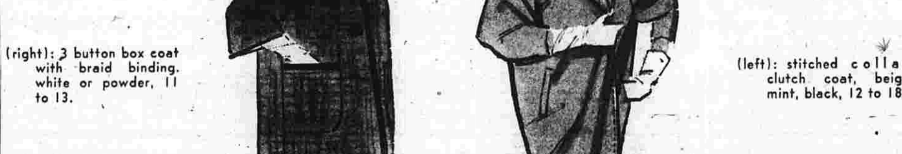
(right): 3 button box coat with braided binding, white or powder, 11 to 13.